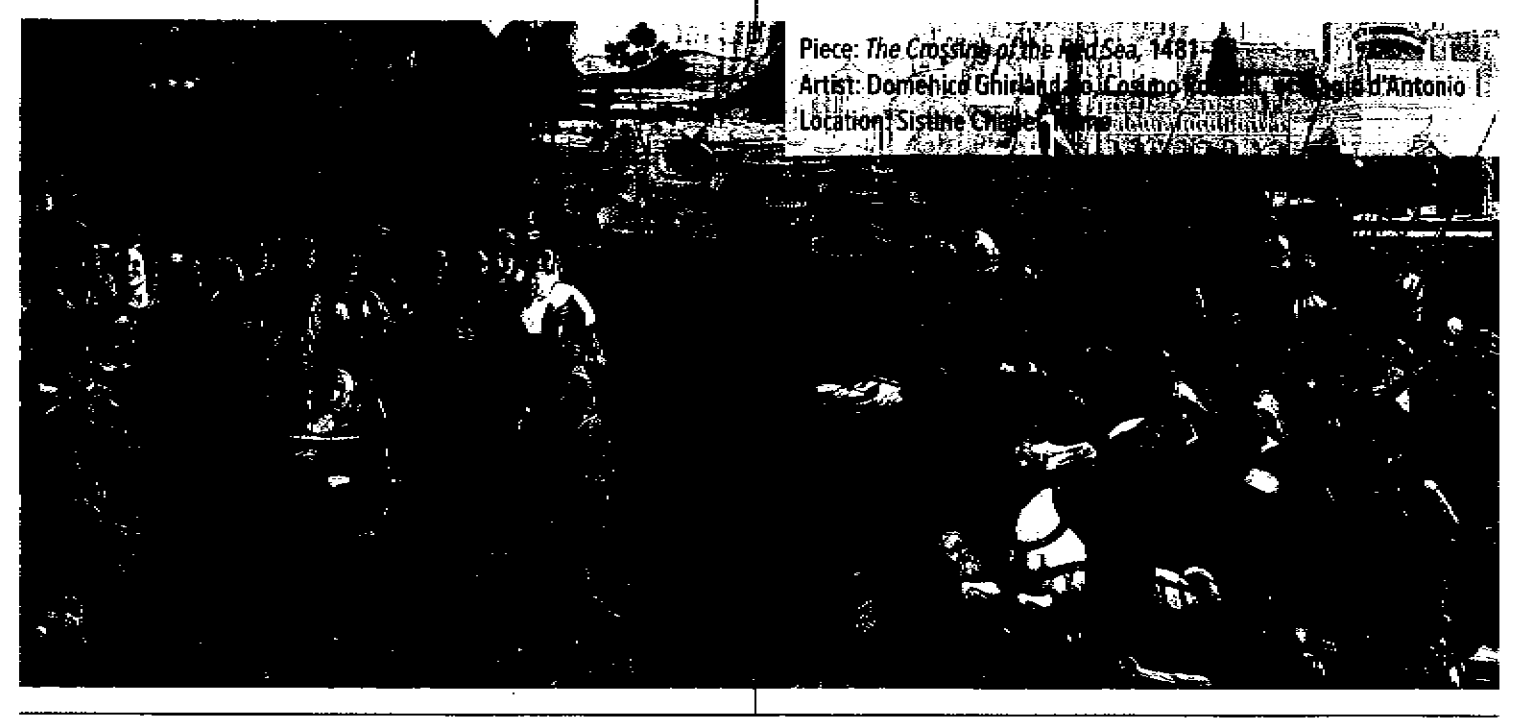
"Them I will bring to my holy mountain and make them joyful in my house of prayer" (Isaiah 56:7).